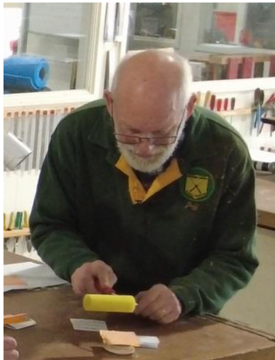
Applying the gold leaf (which stayed attached to the backing paper). It was then rubbed gently with a foam roller.