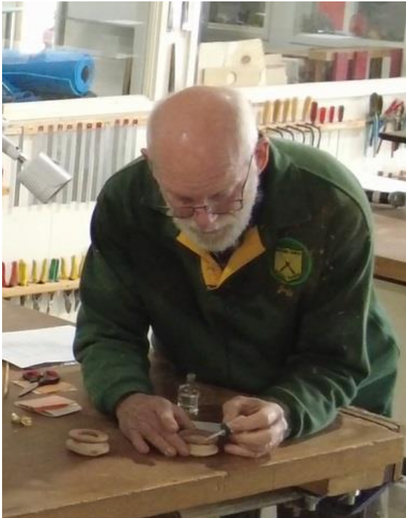
Applying nail polish to the donut.